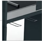
Hooks for Bags