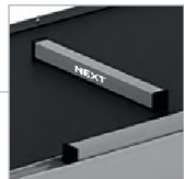
'Next Buyer' Divider